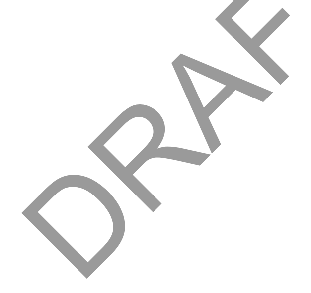
Table 6 - Accomplishments – Program Year & Strategic Plan to Date